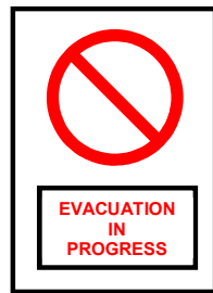
Figure 1: “EVACUATION IN PROGRESS” signage