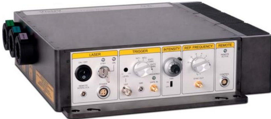
Figure 1: Image of the user interface of the laser.